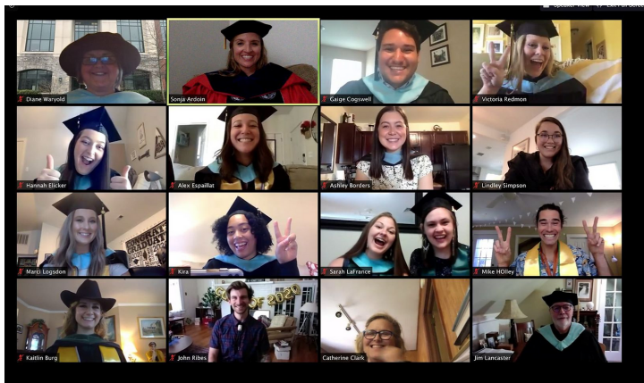
SAA Virtual Graduation Ceremony

At a time when we're all feeling pretty low, we wanted to prepare this special issue as a way to showcase some of the good things that have happened in HPC since Covid-19 sent us home in March.