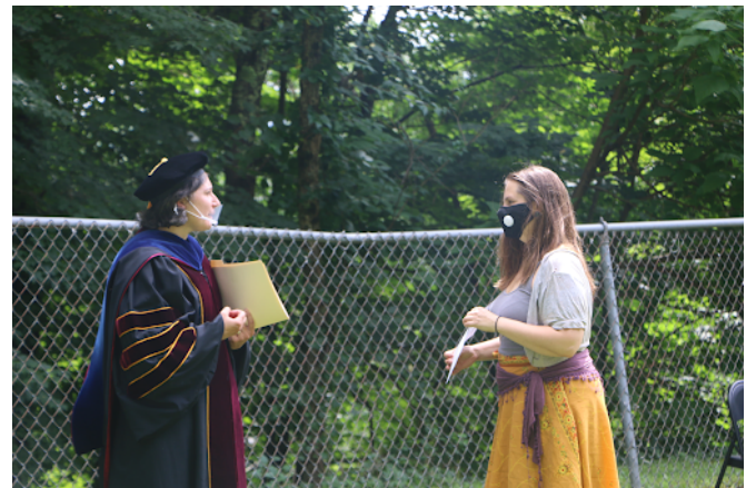
MFT Socially-Distanced Graduation Ceremony